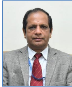
Secretary (DARE) & Director General, ICAR Chief Guest

September 12 - 14, 2024 Science City, Kolkata, West Bengal, INDIA