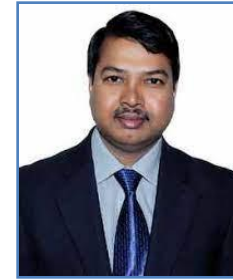
DDG (Fisheries Science), ICAR Special Guest